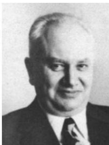
S.S. Kutateladze (1914–1986)