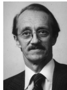
D.B. Spalding (1923–2016)