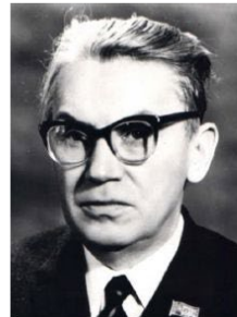
A.V. Luikov (1910–1974)