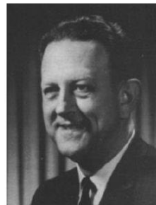
W.M. Rohsenow (1921–2011)