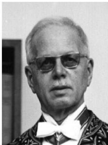
E.A. Brun (1898–1979)