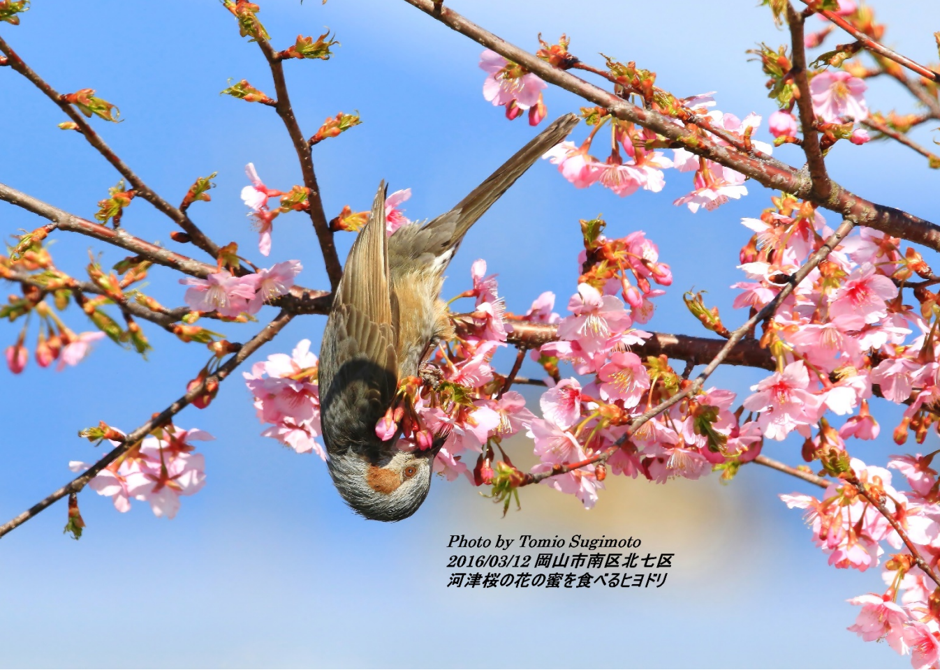
2016/03/12 岡山市南区北七区 河津桜の花の蜜を食べるヒヨドリ