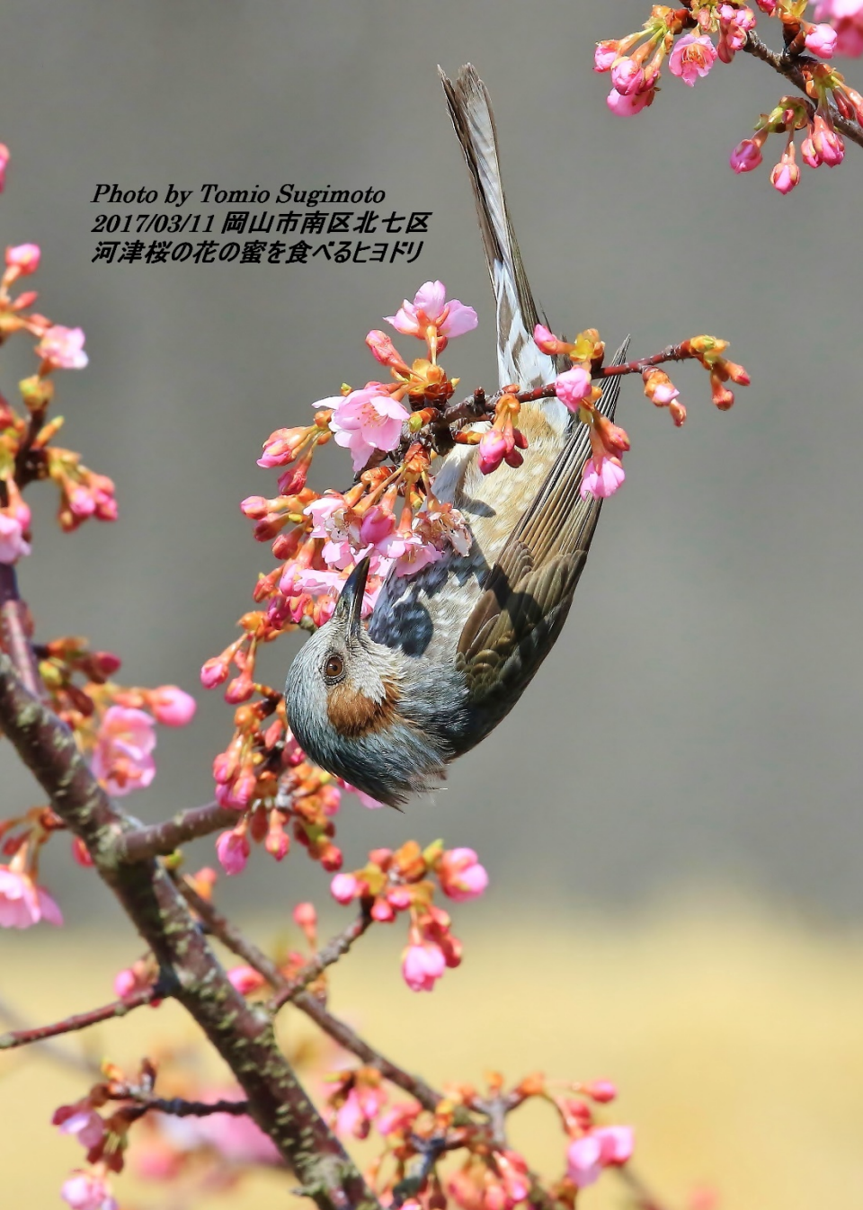
2017/03/11 岡山市南区北七区 河津桜の花の蜜を食べるヒヨドリ