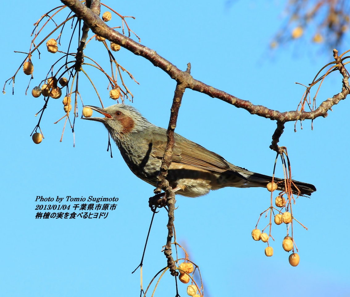
2013/01/04 千葉県市原市 梅植の実を食べるヒヨドリ