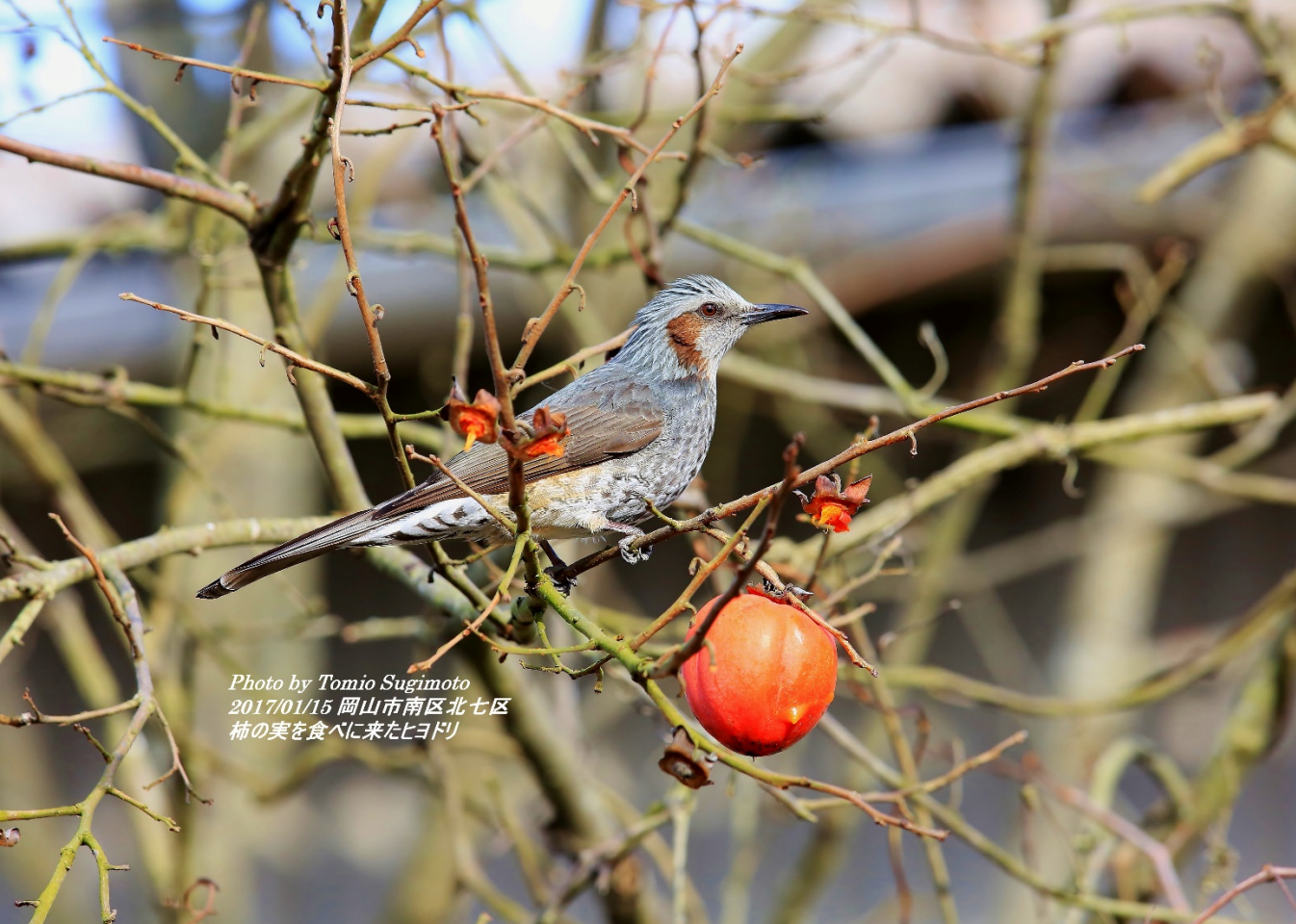
2017/01/15 岡山市南区北七区 柿の実を食べに来たヒヨドリ